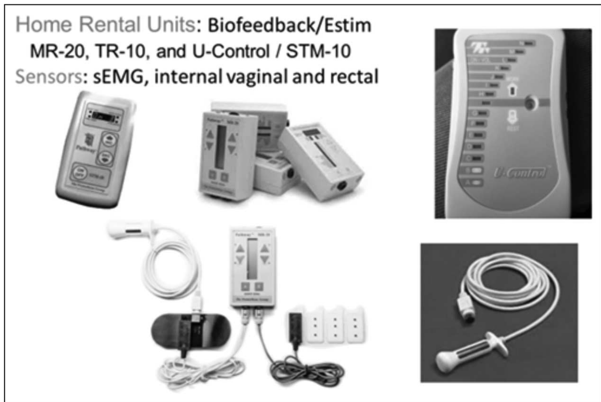
FIGURE 2. Biofeedback equipment. Biofeedback uses a vaginal or rectal pressure sensor to provide an audible and/or visual feedback of the strength of the muscle contraction.

shown that pelvic floor activation can inhibit bladder contraction [31]. One theory suggests that pelvic floor muscle contraction can improve conscious control of bladder function by activating the frontal cortex of the brain, which is responsible for the voluntary urinary inhibition reflex [32]. A second theory suggests that pelvic floor activation of the puborectalis and the external urethral and anal sphincters can relax the detrusor muscle via mechanisms of reciprocal inhibition [33]. PFPT can be used in the management of UUI by activating pelvic floor muscles to inhibit detrusor overactivity and avoid urinary leakage.